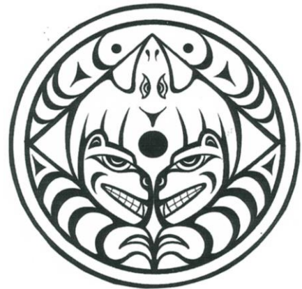
Figure 5. This image is a design for the front of the large spindle whorl that sits near the back of the set. Can you spot the two spirit bears, two salmon, and raven?

The Kwantlen are part of the Stó:lō Nation (or river people ) inhabiting the river around the Fraser Valley. The Sto:lo share a common language known as Halkomelem (Halq'eméylem), of the Coast Salish language family. Since time immemorial, the Kwantlen First Nations people live by the seven traditional laws that guided their ancestors: health, happiness, generations, generosity, humbleness, forgiveness and understanding. Through learning, family, health, their culture and traditions and looking after their lands and resources, they are tireless in their spirit to make a better world for future generations. In working together and learning from their Elders, they are respectful, proud, independent and responsible.