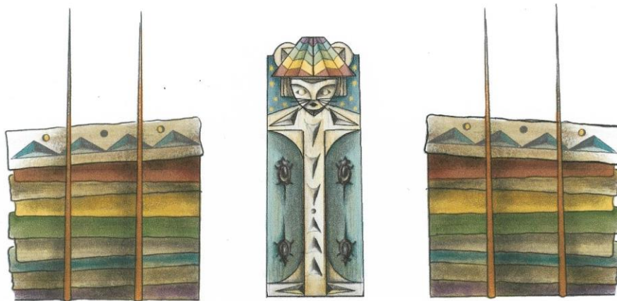
Figure 6. This is a design drawing by Jay Havens, inspired by traditional long houses and totem door entrances. This particular house belongs to Kw'at'el, the mouse. You can tell because of the mouse imagery on the totem door entrance.

The Musqueam people have lived in their present location for thousands of years. Their traditional territory occupies what is now Vancouver and surrounding areas. The name Musqueam relates back to the River Grass, the name of the grass is məθkʷəy̓. There is a story that has been passed on from generation to generation that explains how they became known as the xʷməθkʷəy̓əm (Musqueam) - People of the River Grass.