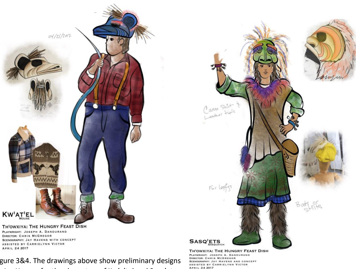
Figure 3&4. The drawings above show preliminary designs by Jay Havens for the characters of Kw'a'tel and Sasq'ets.

>> First People's Principles of Learning provided by First Nations Education Steering Committee. ( http://www.fnesc.ca )