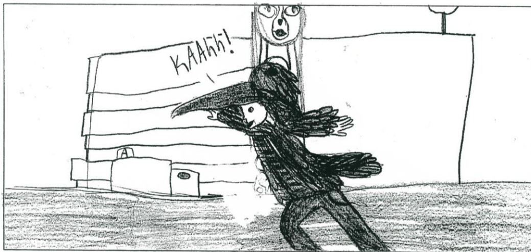
Figure 7. Here is another student drawing, this one is a representation of the character Sqweqs, the raven. Can you guess which part of the show the student captured?