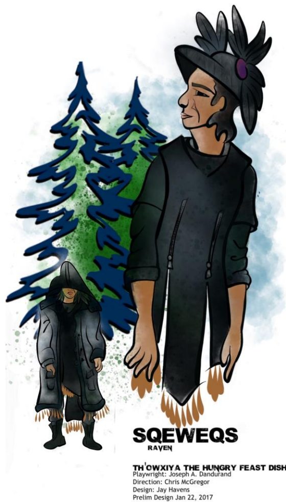
Figure 8&9. Another design by Jay Havens for the character of Sqeweqs. Can you see the difference between the initial design in figure 8 (left) and the current costume in figure 9 (right)?